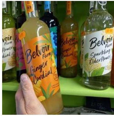
Belvoir Ginger Cordial