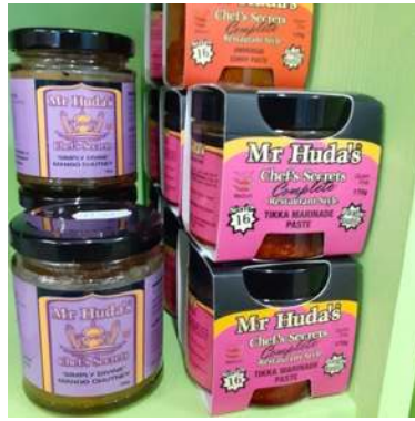
Mr Huda's Universal Curry Paste + Tikka Masala Paste + Mango Chutney