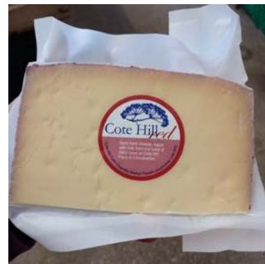
Cote Hill Red