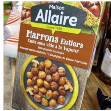
Cooked, peeled chestnuts £5.00