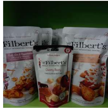
Mr Filbert's Snacks