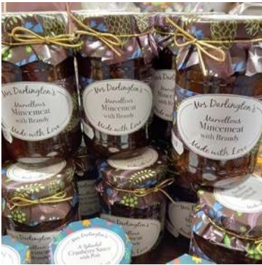
Mrs Darlington's Mincemeat with Brandy