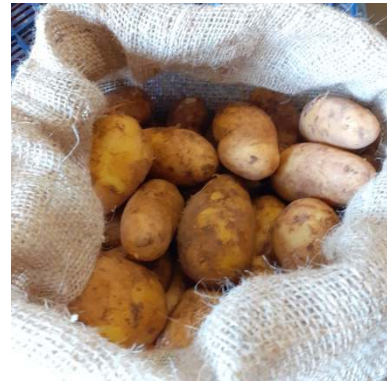
Majorcan New Potatoes