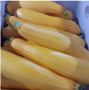
Dutch Yellow Courgettes