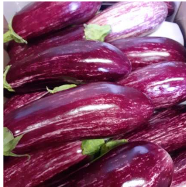
Dutch Graffiti Aubergines