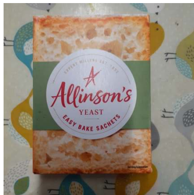
Allinson's Yeast £1.49