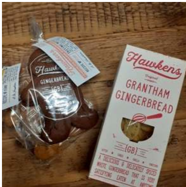
Hawken's Gingerbread from Grantham

Twin Pack of Chocolate Orange or Lemon Gingerbread Men.