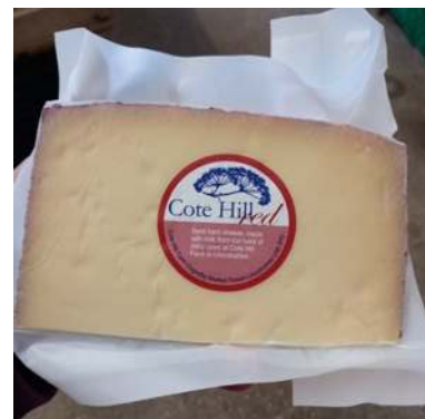
Cote Hill Red £3.60