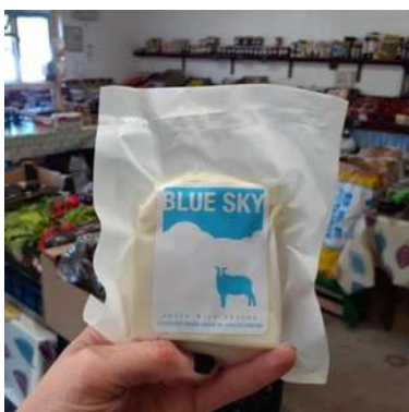
Blue Sky Halloumi SOLD OUT