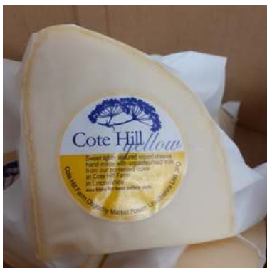
Cote Hill Yellow SOLD OUT