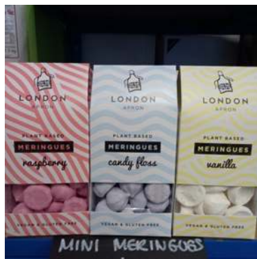
London Apron Meringues Gluten Free & Vegan