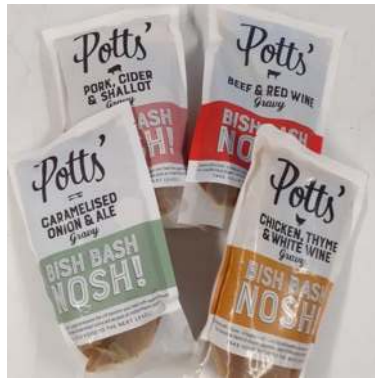
Pott's Gravies £2.70 Pork / Onion / Chicken / Beef