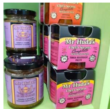
Mr Hudas Universal Curry Paste + Tikka Masala Paste + Mango Chutney