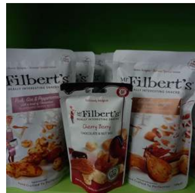
Mr Filbert's Snacks Pink Gin & Peppercorn Nuts £2.95