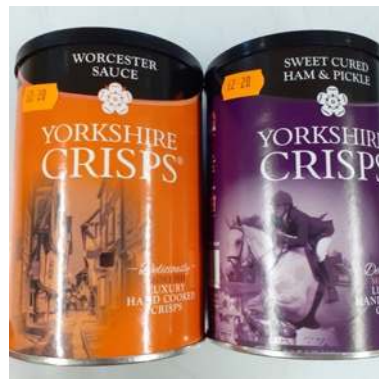
Yorkshire Crisps £2.20 Worcester Sauce or Sweet Cured Ham & Pickle