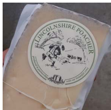
Lincolnshire Poacher Cheese 200g Wedge £3.40