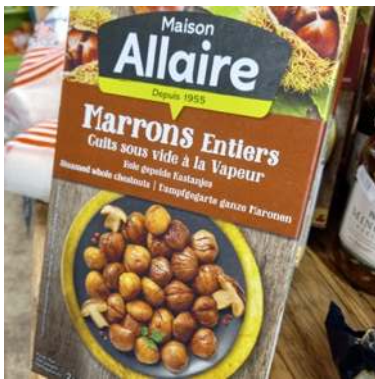
Cooked, peeled chestnuts £5.00