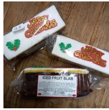
Pocklington's Iced Fruit Slab £3.35