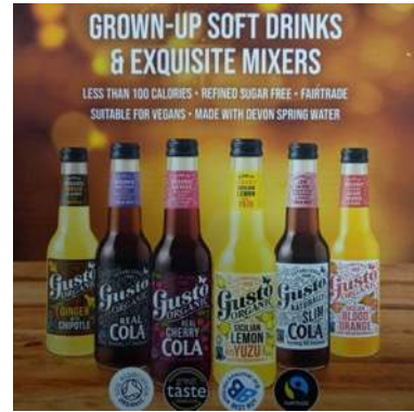
Gusto Organics £1.75