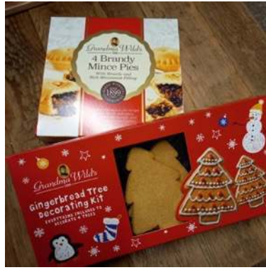
Grandma Wilds Mince Pies £1.45 Gingerbread Decorating £3.00