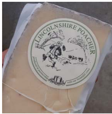
Lincolnshire Poacher Cheese