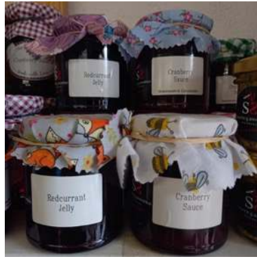
Saints & Sinners