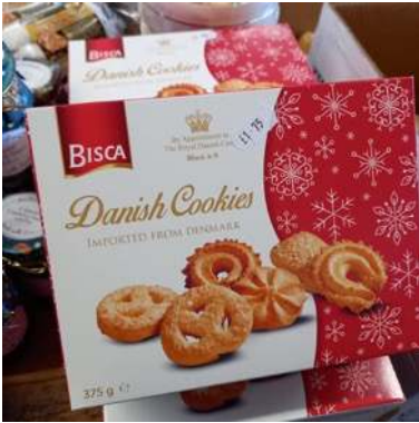
Danish Cookies £1.75