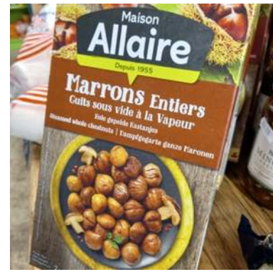
Cooked, peeled chestnuts £5.00