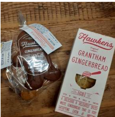
Hawken's Gingerbread from Grantham

Twin Pack of Chocolate Orange or Lemon Gingerbread Men.