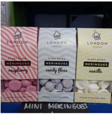
London Apron Meringues Gluten Free & Vegan