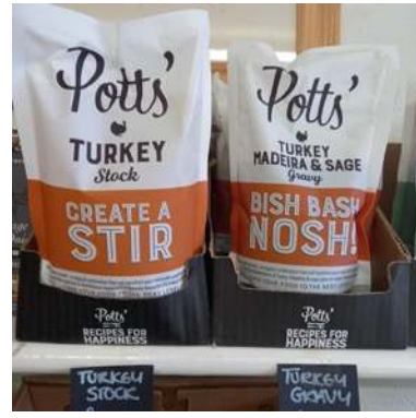
Pott's Turkey Gravy £2.70 Pott's Turkey Stock £1.80