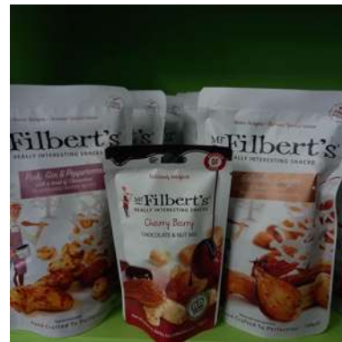
Mr Filbert's Snacks