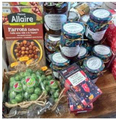
Darlington's Cran Sauce £2.50 Spices for Mulled Wine 80p Chocolate Sprouts £4.65