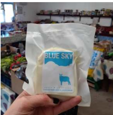
Blue Sky Halloumi £3.40