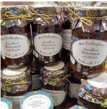
Mrs Darlington's Mincemeat with Brandy