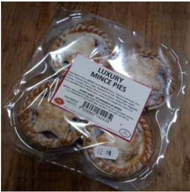
Luxury Mince Pies £2.50