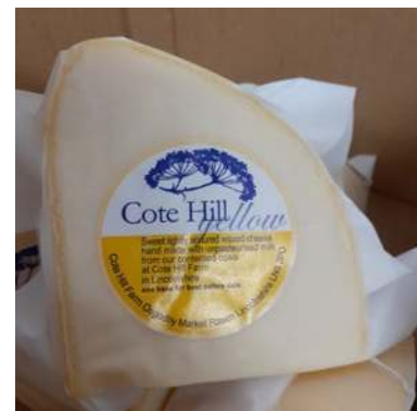
Cote Hill Yellow £3.40