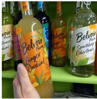
Belvoir Ginger Cordial