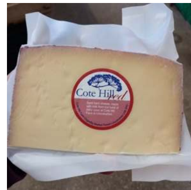
Cote Hill Red