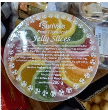
Jelly Slices £3.15