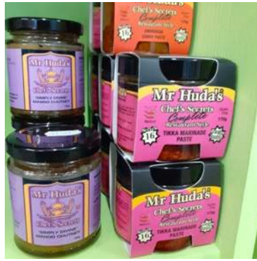
Mr Huda's Universal Curry Paste + Tikka Masala Paste + Mango Chutney