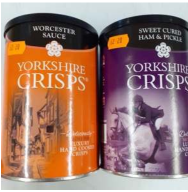
Yorkshire Crisps £2.20 Worcester Sauce or Sweet Cured Ham & Pickle