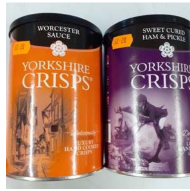
Yorkshire Crisps £2.20 Worcester Sauce or Sweet Cured Ham & Pickle