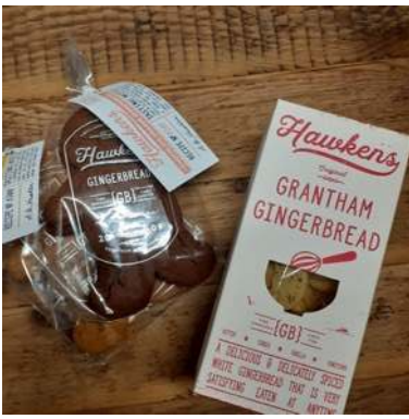
Hawken's Gingerbread from Grantham

Twin Pack of Chocolate Orange or Lemon Gingerbread Men.