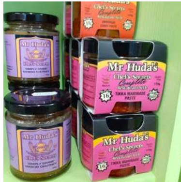
Mr Huda's Universal Curry Paste + Tikka Masala Paste + Mango Chutney