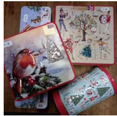
Grandma Wild Tins Robin £5.50, Long Tin £6.15 12 Days Large Square £7.20 And Nutcracker music £8.75