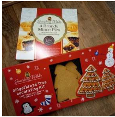
Grandma Wilds Mince Pies £1.45 Gingerbread Decorating SOLD OUT