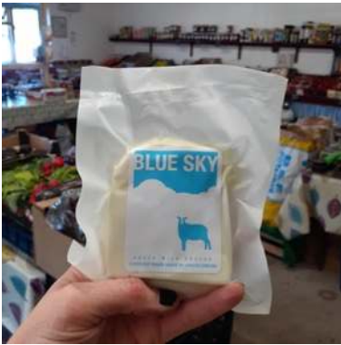
Blue Sky Halloumi £3.40