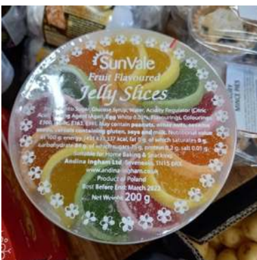
Jelly Slices £3.15