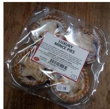
Luxury Mince Pies £2.50