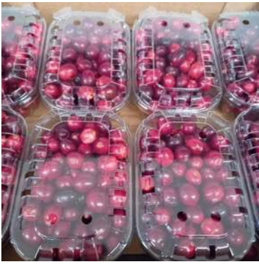
Fresh Cranberries Ocean Spray 340g £1.95