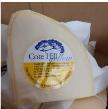
Cote Hill Yellow £3.60