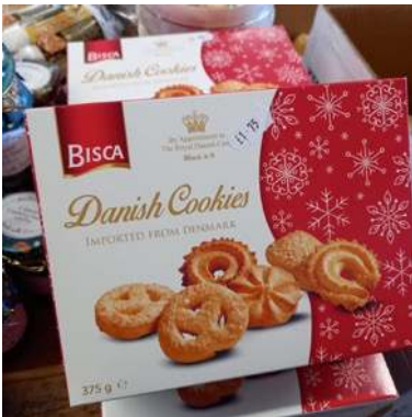
Danish Cookies £1.75