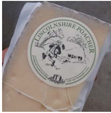
Lincolnshire Poacher Cheese