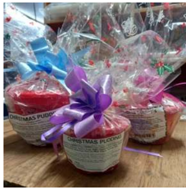
Pocklington's Christmas Puddings – Small £1.90, Medium £3.60 & Large £5.85