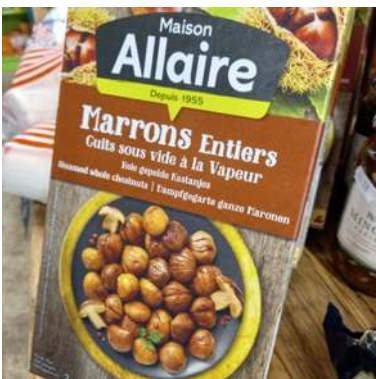
Cooked, peeled chestnuts £5.00