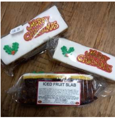
Pocklington's Iced Fruit Slab £3.35