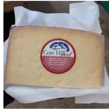
Cote Hill Red