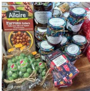
Darlington's Cran Sauce £2.50 Spices for Mulled Wine 80p Chocolate Sprouts £4.65