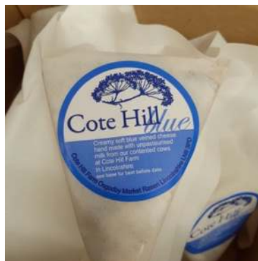
Cote Hill Blue £3.20